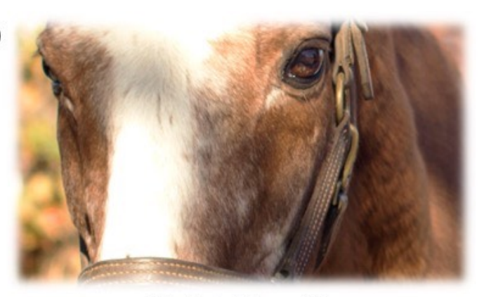
This class is in honor of Ibis, The Connector & Transformer of Hearts & For All Animals, and People